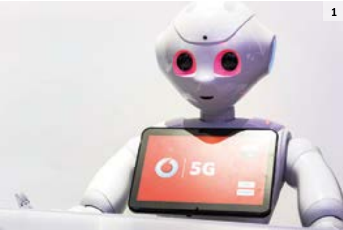
1 Working with experts from the Technische Universität Dresden – Vodafone equipped the Pepper industrial robot to instantly interact with humans. Pepper reacts to gestures as quickly as the human nervous system.