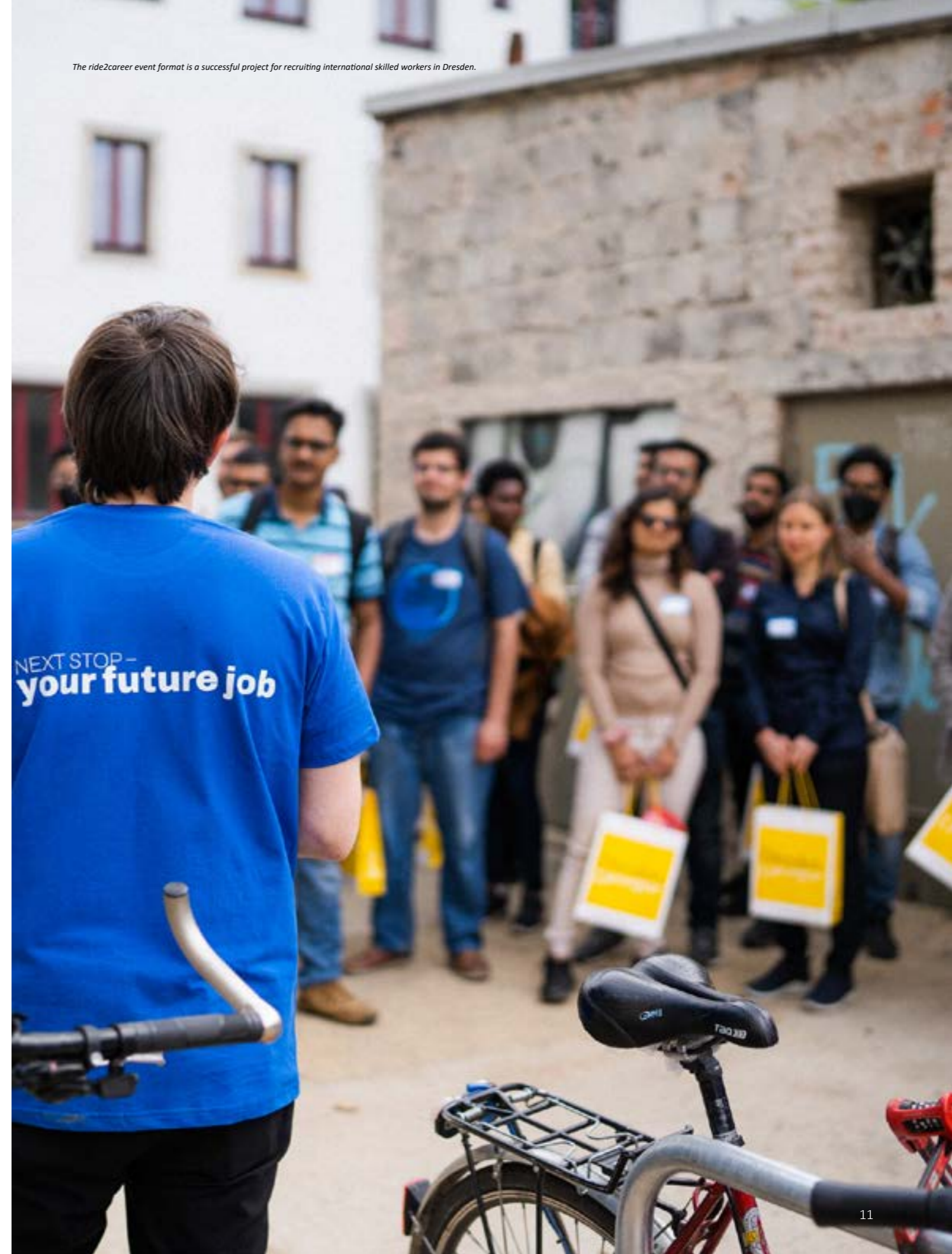
The ride2career event format is a successful project for recruiting international skilled workers in Dresden.