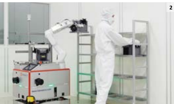
2 The transport hero: with its robot system, Fabmatics has developed a driverless transportation system for the factories of the future.