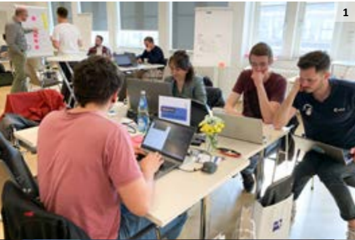
1 Developing innovative ideas – with Dresden businesses: The Thin[g]kathon at the Smart Systems Hub makes this possible.