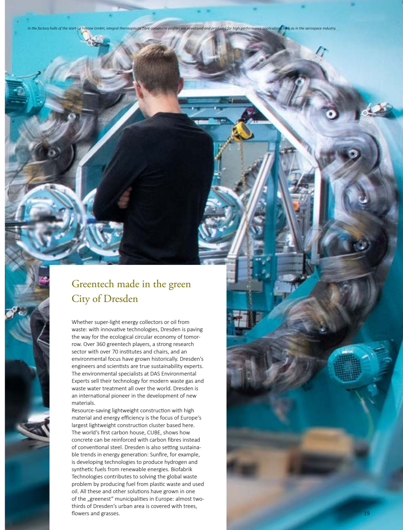
In the factory halls of the start-up herone GmbH, integral thermoplastic fibre composite profiles are developed and produced for high-performance applications such as in the aerospace industry.

René Reichardt CEO DAS Environmental Experts