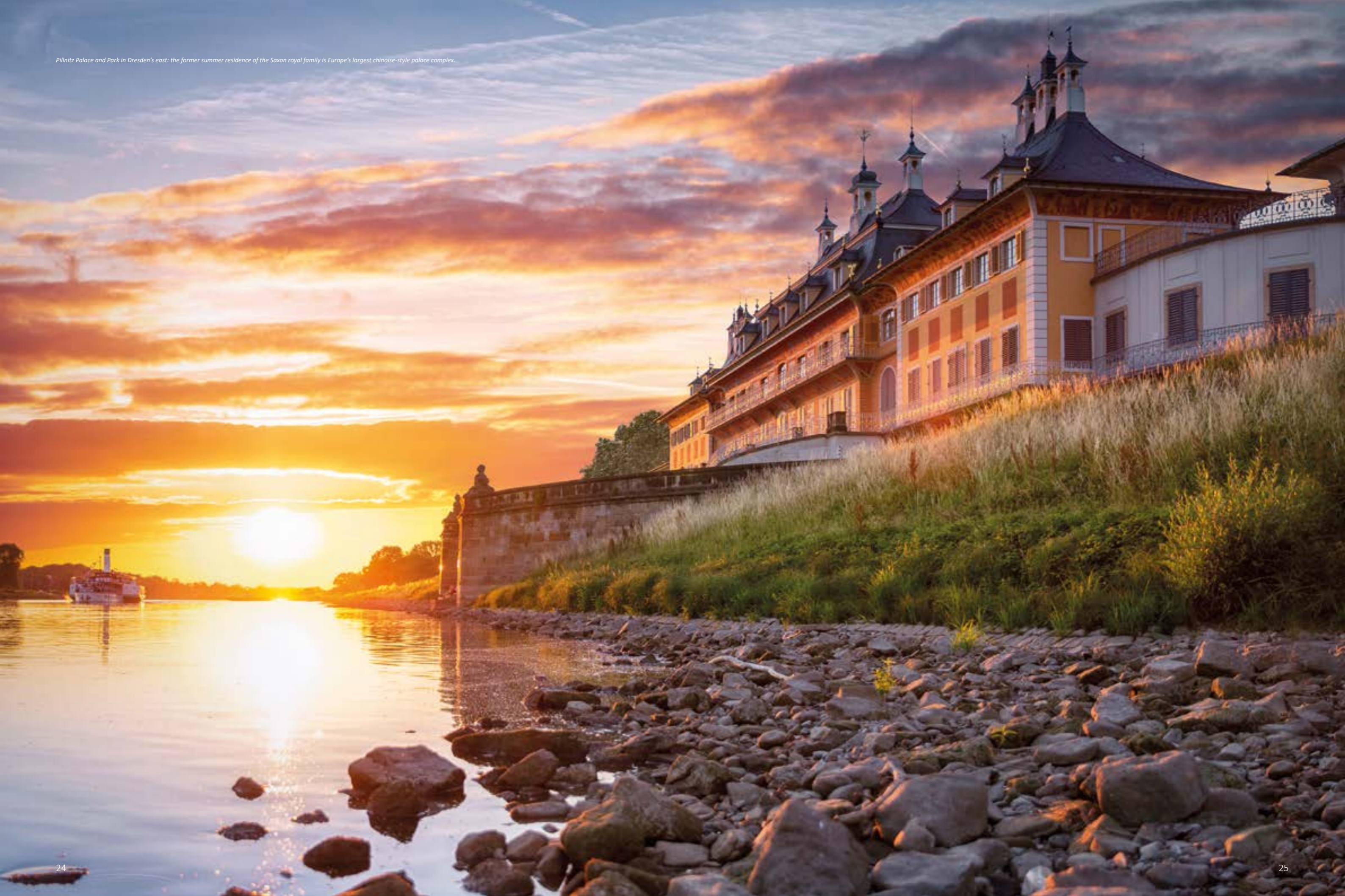
Pillnitz Palace and Park in Dresden's east: the former summer residence of the Saxon royal family is Europe's largest chinoise-style palace complex.