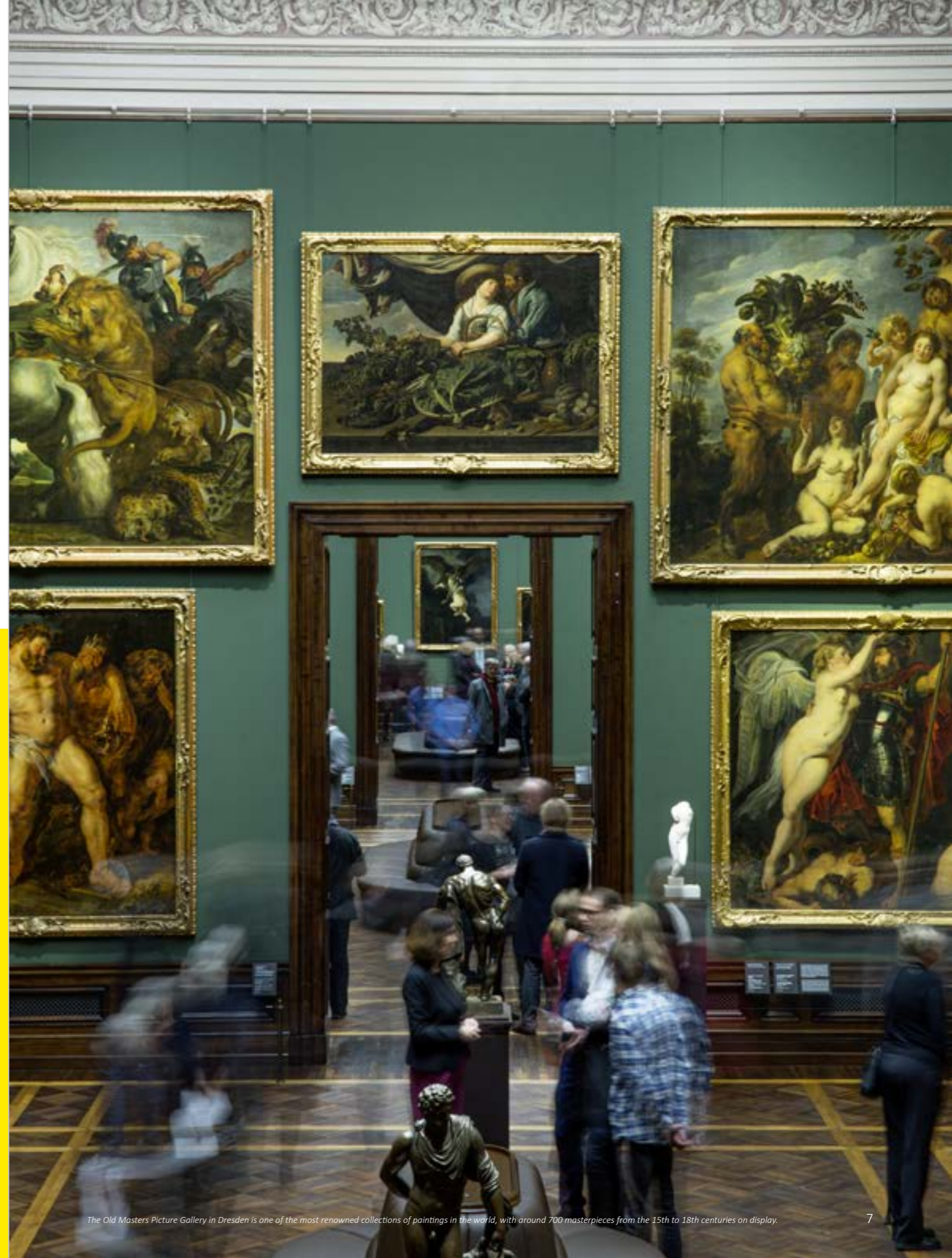
The Old Masters Picture Gallery in Dresden is one of the most renowned collections of paintings in the world, with around 700 masterpieces from the 15th to 18th centuries on display.

Marion Ackermann Director General of the Dresden State Art Collections (Staatliche Kunstsammlungen Dresden)