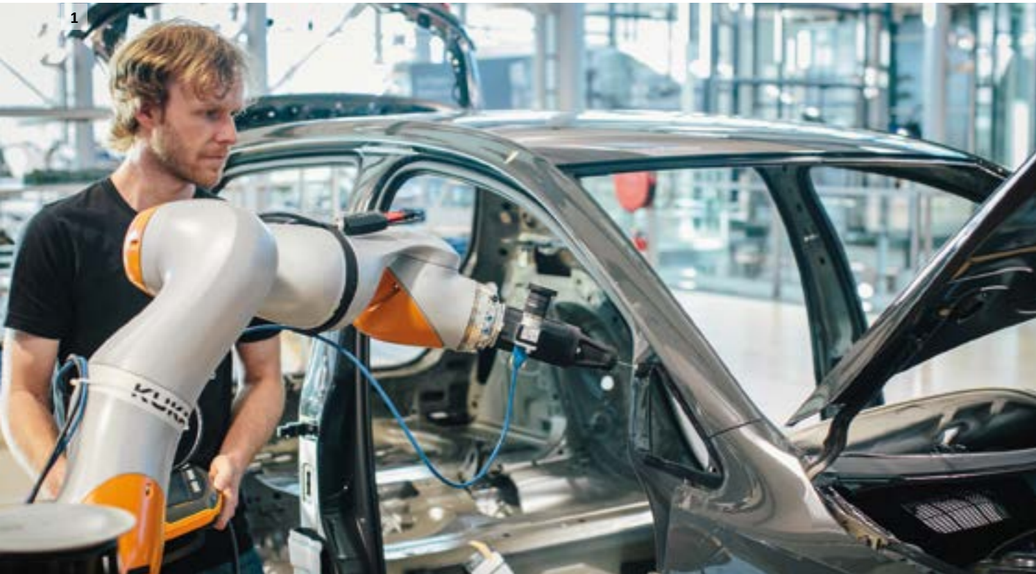
1 Volkswagen's Transparent Factory in Dresden is focused on robot-based solutions.