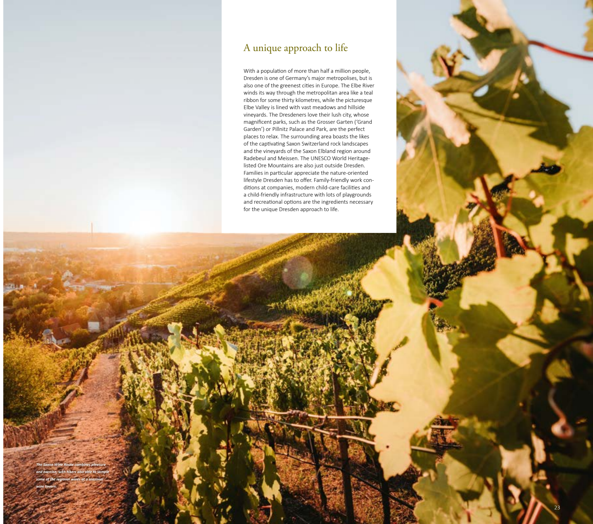
The Saxon Wine Route combines pleasure and exercise, with hikers also able to sample some of the regional wines at a seasonal wine tavern.

With a population of more than half a million people, Dresden is one of Germany's major metropolises, but is also one of the greenest cities in Europe. The Elbe River winds its way through the metropolitan area like a teal ribbon for some thirty kilometres, while the picturesque Elbe Valley is lined with vast meadows and hillside vineyards. The Dresdeners love their lush city, whose magnificent parks, such as the Grosser Garten ('Grand Garden') or Pillnitz Palace and Park, are the perfect places to relax. The surrounding area boasts the likes of the captivating Saxon Switzerland rock landscapes and the vineyards of the Saxon Elbland region around Radebeul and Meissen. The UNESCO World Heritage-listed Ore Mountains are also just outside Dresden. Families in particular appreciate the nature-oriented lifestyle Dresden has to offer. Family-friendly work conditions at companies, modern child-care facilities and a child-friendly infrastructure with lots of playgrounds and recreational options are the ingredients necessary for the unique Dresden approach to life.