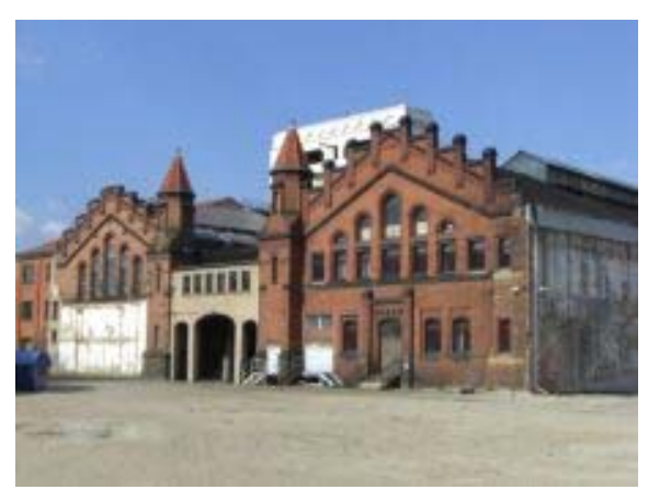
Future cultural centre "Heizkraftwerk Mitte" (former district heating and power plant)