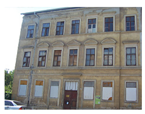
Alleviating flat vacancies