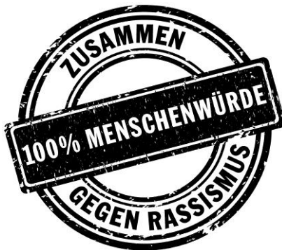
Logo: Foundation for the International Action Week Against Racism

The International Action Week Against Racism is a nationwide event series for solidarity with the opponents and the victims of racism. In November 2016 the mayor of Dresden, Dirk Hilbert called on the people of Dresden to participate in the event series in order to “show what the majority of Dresdeners stand for: A peaceful cohabitation and solidarity in a city where all its inhabitants, regardless of their national, cultural, religious or social affiliation, can lead a secure life in dignity and justice.” The result is a versatile programme. Please find more detailed information on the event at www.dresden.de/iwgr